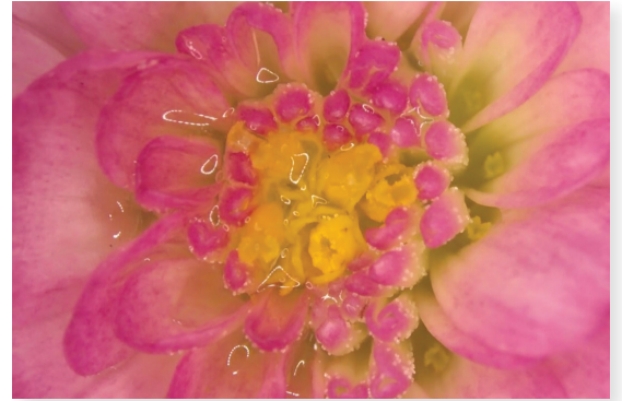
4K Ultra HD Capture High Resolution Images