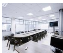
Lighting & Controls