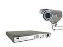
Security & Safety Systems