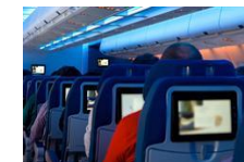
AEROSPACE Galley and Entertainment Equipment

What industries use EMI filters: Aerospace, Appliances, Automation & Control, Communications & Wireless Equipment, Connected Home, Consumer Solutions, Data Centers, Defense & Military, Energy & Utilities, Hybrid & Electric Mobility, Industrial Machinery, Intelligent Buildings, Medical & Healthcare Oil & Gas / Marine, Rail, Subsea Communications, Truck, Bus & Off-Road Vehicles