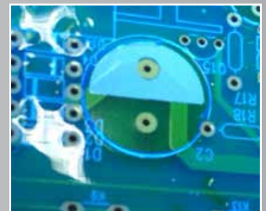
TECHNOMELT AS 8998 masking material used with conformal coating, before peel (left), and with excellent definition after peel (right).