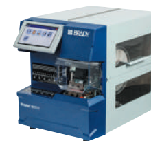
Wraptor A6500 (300 dpi)