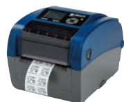
BBP®12 Label Printer (300 dpi)