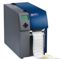
BBP®72 Printer (300 dpi)