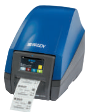
BradyPrinter i5100 (300 dpi) / (600 dpi)