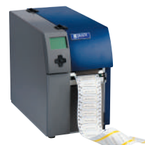
BBP®72 Printer (300 dpi)