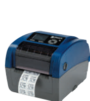
BBP®12 Label Printer (300 dpi)

Once you know which label material you need for your next design, the next step is finding the right printer to create quality labels on-demand. Brady has a variety of high-performance, reliable printers to choose from.