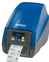
BradyPrinter i5100 (300 dpi) / (600 dpi)