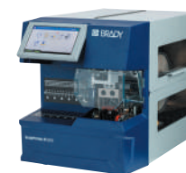
BradyPrinter A5500 (300 dpi)