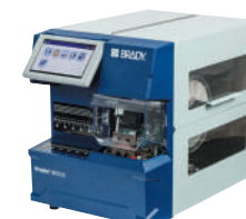
Wraptor A6500 (300 dpi)