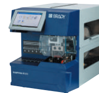
BradyPrinter A5500 (300 dpi)