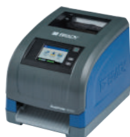
BradyPrinter i3300 (300 dpi)