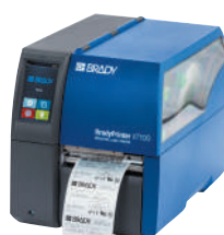
BradyPrinter i7100 (300 dpi) / (600 dpi)