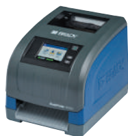
BradyPrinter i3300 (300 dpi)