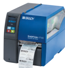
BradyPrinter i7100 (300 dpi) / (600 dpi)