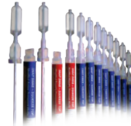
LOCTITE® 3311™ offers adhesion to various swab substrates, resulting in a safer and more reliable device.

The new product was designated the SnapSwab™ and consisted of a Dacron® swab tip on a polystyrene shaft encased in a polyethylene tube. It was necessary to reliably attach the swab to the inside of the tube and ensure the entire assembly was leakproof. LOCTITE® 3311™, a single-component light cure acrylic adhesive, was the adhesive of choice for the new swab device. Rapid, semi-automated processing and high adhesion to the various swab substrates resulted in a safe, convenient, dependable, and inexpensive device.