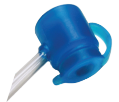
LOCTITE® 3922™ bonds thermoplastic inlet valve assembly.

Using the LOCTITE® 7700™* Hand-Held LED Light Source with LOCTITE™ 3922™ Medical Device Light Cure Adhesive, US Endoscopy was able to consistently cure the assembly in 10 seconds while nearly doubling the pull strength. The benefits of this light source are that it is inexpensive, small in size, portable, and generates minimal heat and ultraviolet energy, making it safer to work with than traditional UV light sources.