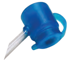
LOCTITE® 3922™ bonds thermoplastic inlet valve assembly.

Using the LOCTITE® 7700™* Hand-Held LED Light Source with LOCTITE™ 3922™ Medical Device Light Cure Adhesive, US Endoscopy was able to consistently cure the assembly in 10 seconds while nearly doubling the pull strength. The benefits of this light source are that it is inexpensive, small in size, portable, and generates minimal heat and ultraviolet energy, making it safer to work with than traditional UV light sources.