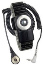
Single or Dual, 5', 6', 12' Fabric, Metal, Disposable