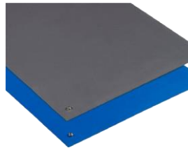
Rubber (soldering), Vinyl Dual or Three Layer all widths, Up to 50'