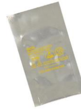
Foil-High Barrier, Aluminum-Low Barrier