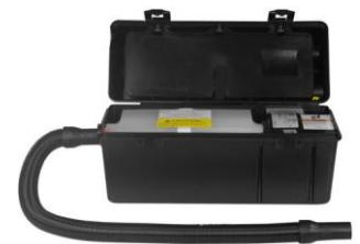
Electronic Service Vacuum