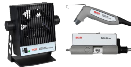
Benchtop, Overhead, Air Gun