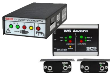
724, WS Aware