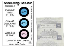
Humidity Indicator Cards, Desiccant