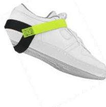
Standard, Cup, Heels, Disposable