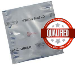
Qualified to MIL-PRF-81705E Type III, Class 2