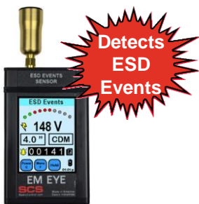
EM Eye - ESD Event Meter