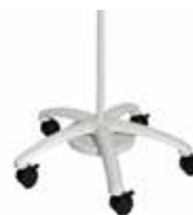
Floor Stand (Trolley) With Extra Weight