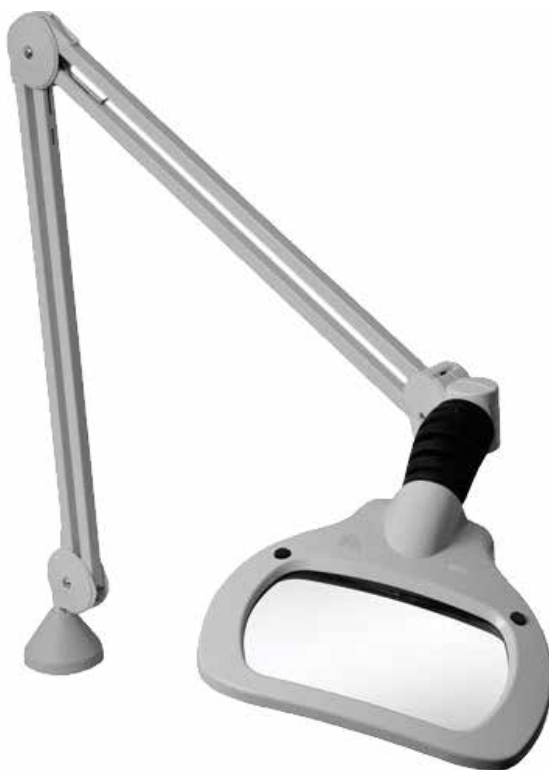
Wave LED / LED ESD / LED UV Magnification

Timer and dimming: Step dimming 0-50-100%. Selectable left / right illumination. Auto shut-off function.