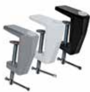
A-Edge Mount Bracket