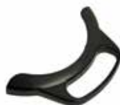
KFM LED Handles