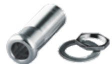
TE Table Bushing