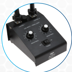
Light Adjustment Knobs for Each Illuminator and On/Off Switch on Metal Base