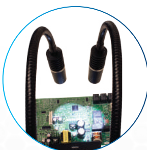
Illuminate and Overlap Spotlights at Any Angle