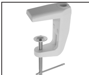
Heavy-Duty Mounting Clamp