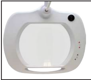
7.5 Inch x 6.2 inch/ 3 Diopter Lens 1.75x Magnification