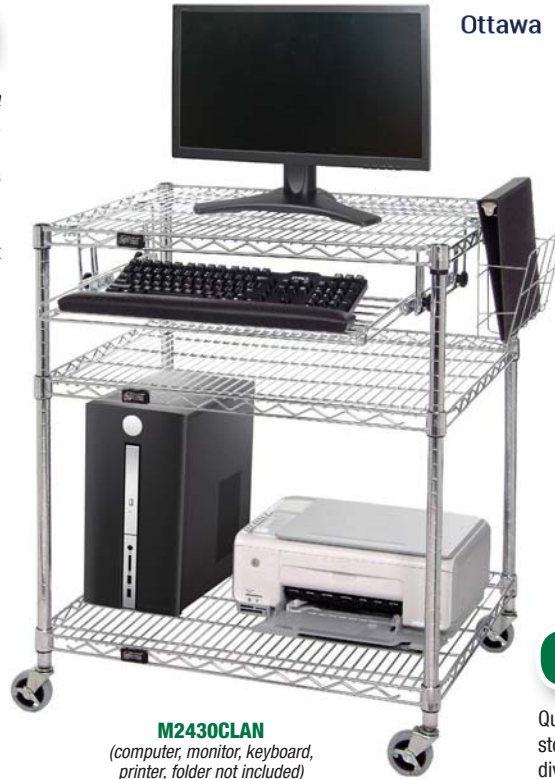
M2430CLAN (computer, monitor, keyboard, printer, folder not included)