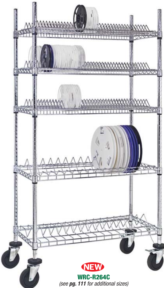
NEW WRC-R264C (see pg. 111 for additional sizes)

Quantum Reel Shelving offers a safe and efficient method of transporting and storing standard size component reels. New reel shelves are chrome plated and can be used in conjunction with same size standard flat wire shelves. Units are available with conductive accessories providing a static safe storage system to address reel handling and providing stationary or mobile complete storage systems for PCB manufacturers. Finish: Chrome